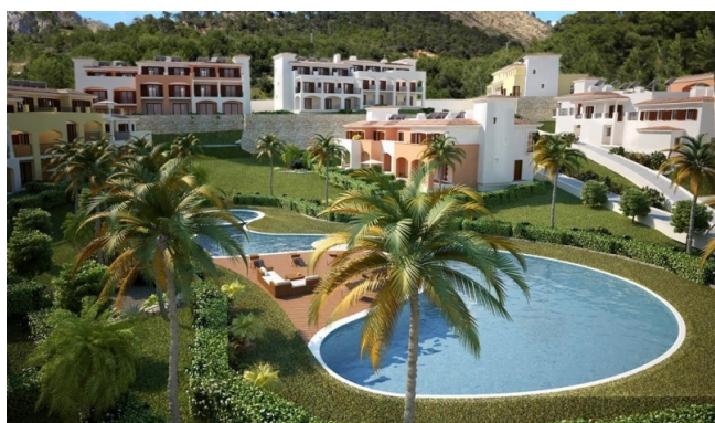
Wohnanlage Camp de Mar