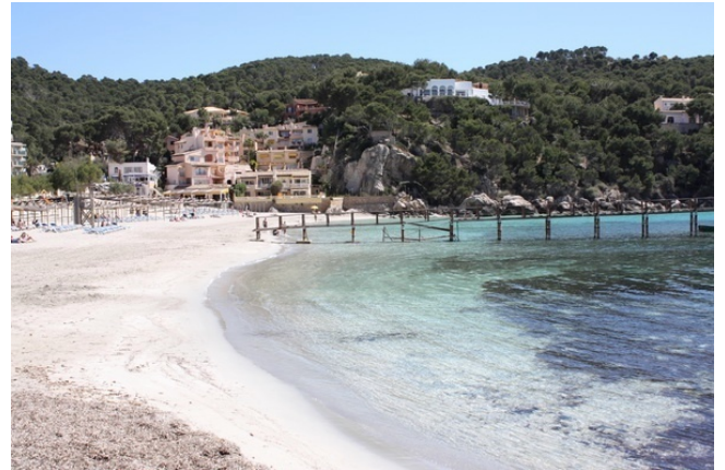
Strand Camp de Mar