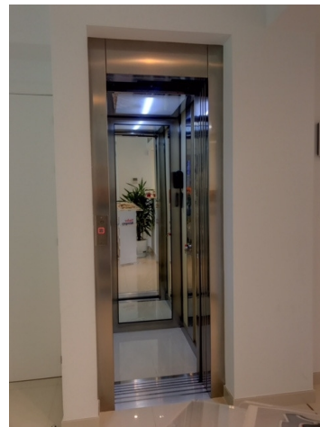
lift camp de mar