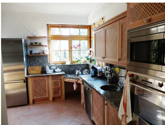
Villa for sale in Mallorca