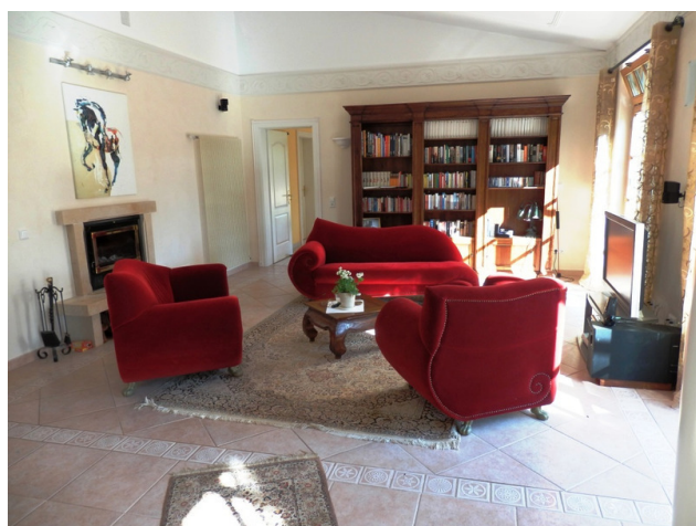
Fantastic property in Mallorca