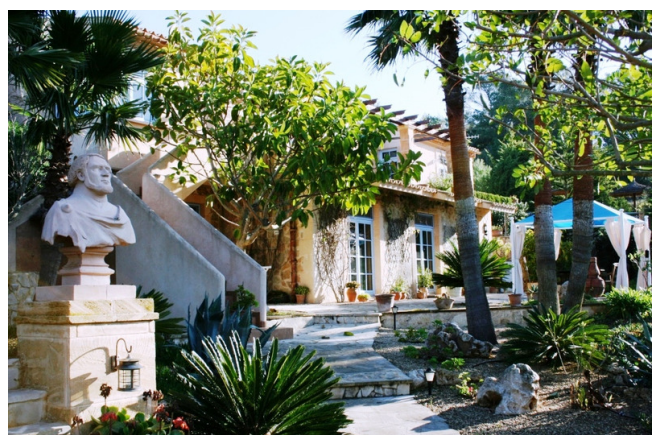
Manacor real estate