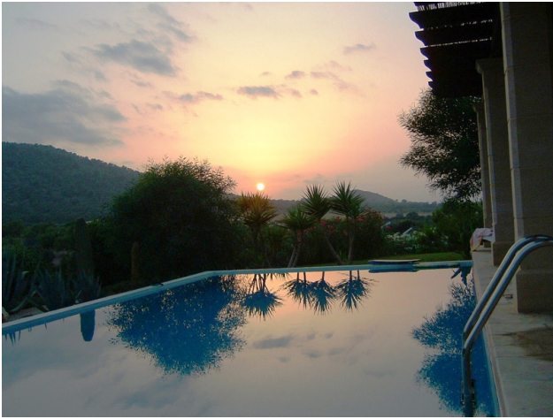
Real estate Manacor