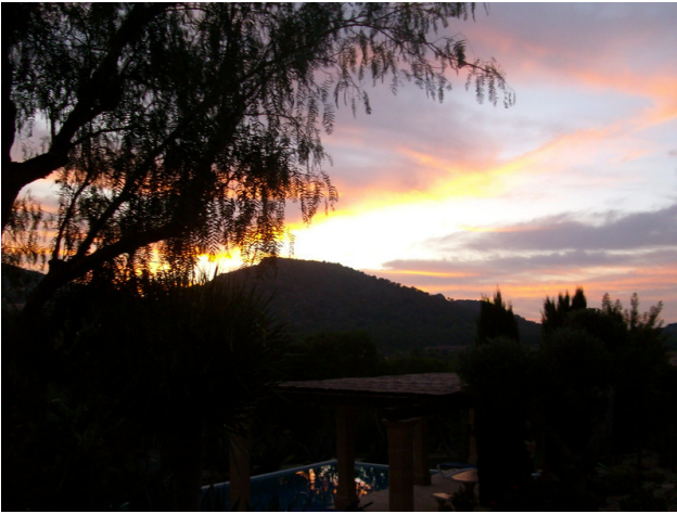
Villa in Mallorca