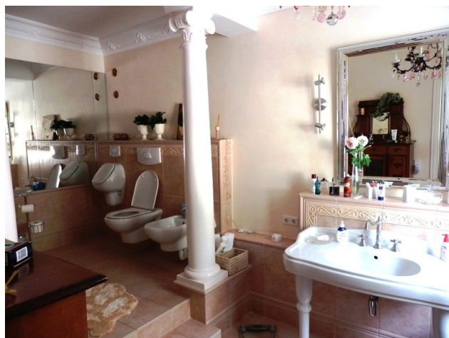
Buy great property