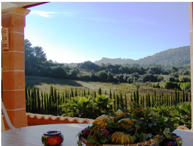
Buy detached house