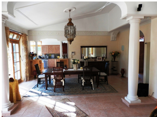
Purchase of a finca