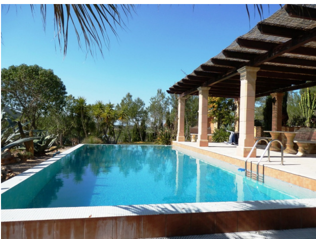
Fantastic finca with pool