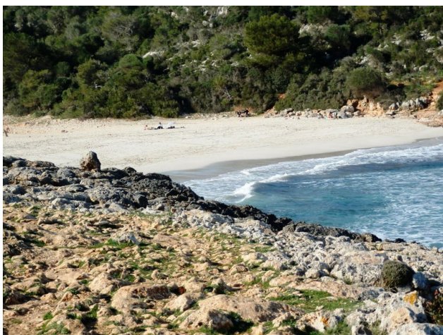
Buy in Mallorca