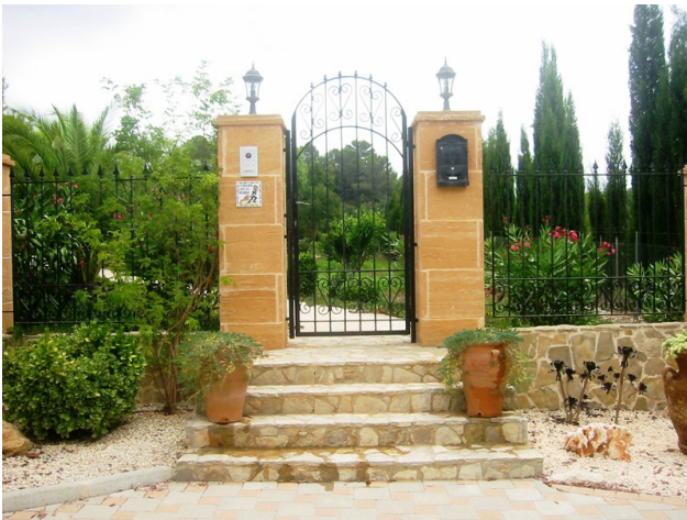
Great Finca in Manacor