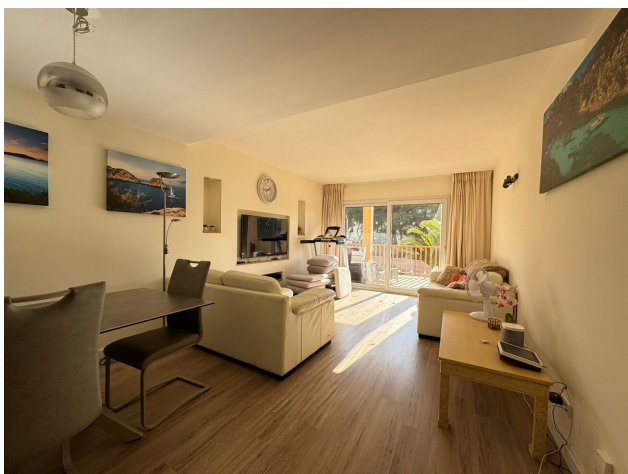
Penthaus Port Adriano