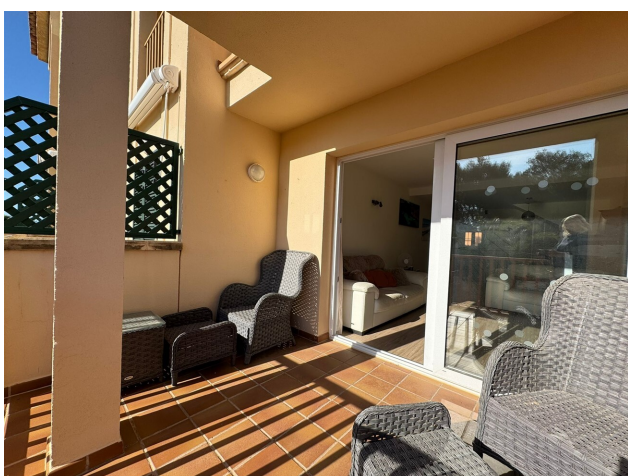
for sale Penthouse majorca