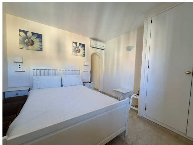
sea view penthouse