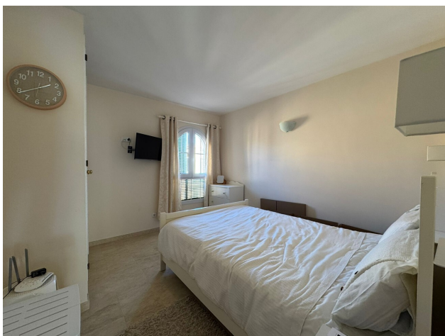
sea view penthouse