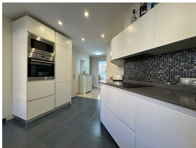
Penthaus kaufen Mallorca