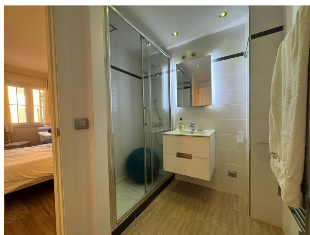
kaufen Mallorca Penthaus