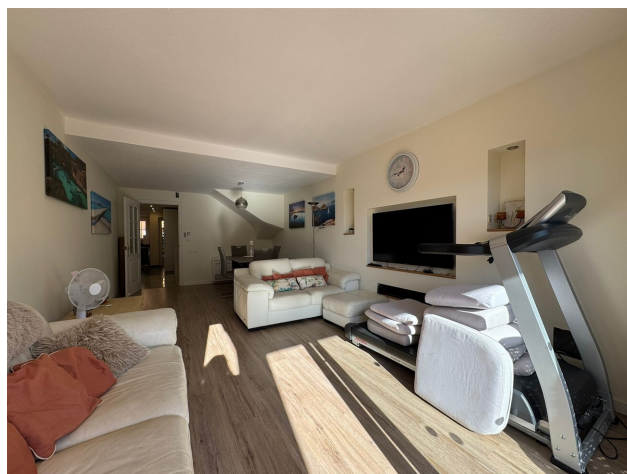
Penthpuse Port Adriano