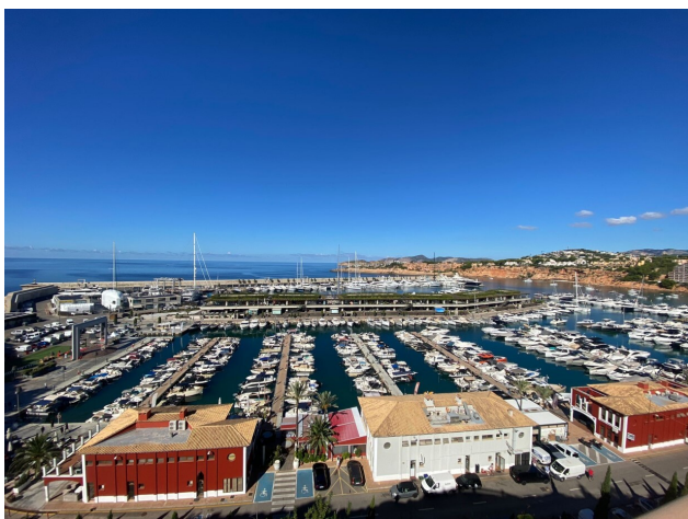
view Port Adriano