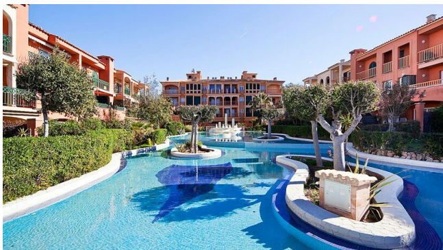
kaufen Port Adriano